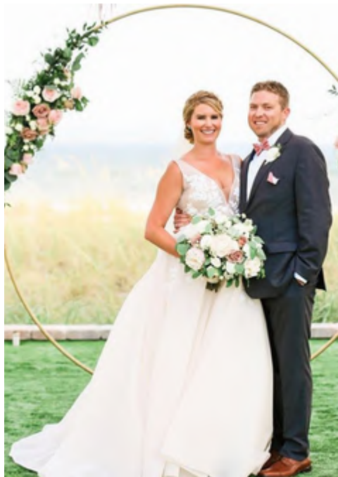
LARGE GOLDEN RING INCLUDED