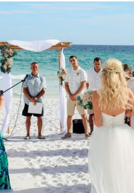
TRADITIONAL BAMBOO ARBOR INCLUDED