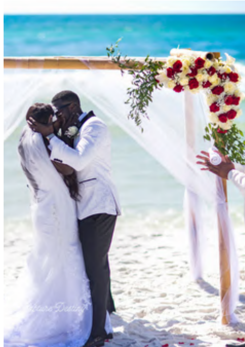
4-POST ARBOR UPGRADE