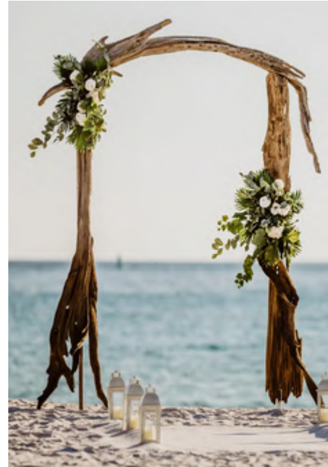
DRFTWOOD ARBOR UPGRADE