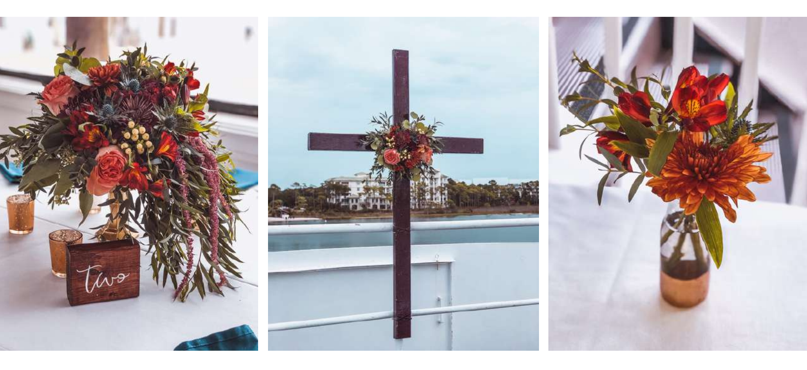
Planning, Design, & Coordination Services 1 Hour of Ceremony Coordination 3 Hours of Reception Coordination Ceremony Timeline & Execution Reception Planning & Design Vendor Coordination Access to Preferred Vendor List