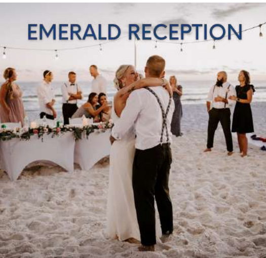
Best suited for a celebration outdoors with a casual catering package included.

If you need assistance in selecting and securing a venue, we recommend starting with our full-service planning package found on page 3.