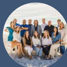
The SunQuest Team

Your dedicated wedding planner will guide you through this little thing called "wedding planning!" They'll assist you in custom designing both ceremony and reception in addition to creating a detailed timeline and floorplan. With your SunQuest wedding planner by your side, planning your destination wedding is a stress-free experience!