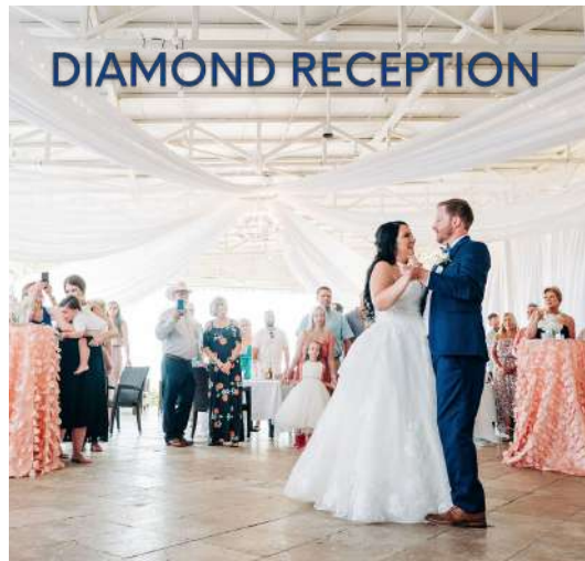
Best suited for a celebration at a traditional venue with a traditional catering package included.