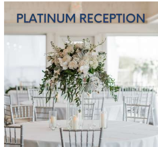
Best suited for a celebration at a traditional venue with an elevated catering package included.